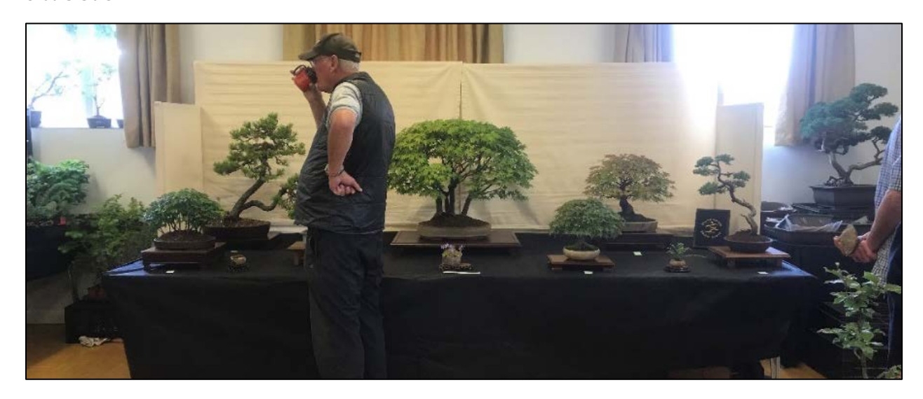
Blackmore Vale's club display.

The doors opened at 10.00 am, and a steady flow of visitors arrived to view the trees, chat with the exhibitors and purchase a few pots and trees. For some reason, visitor numbers were down on last year and the tailed off in the afternoon. Thankfully, the host club had laid on refreshments for all including snacks and cold drinks, which was very welcome, and the fish and chip van arrived at lunch time, providing a very welcome distraction.