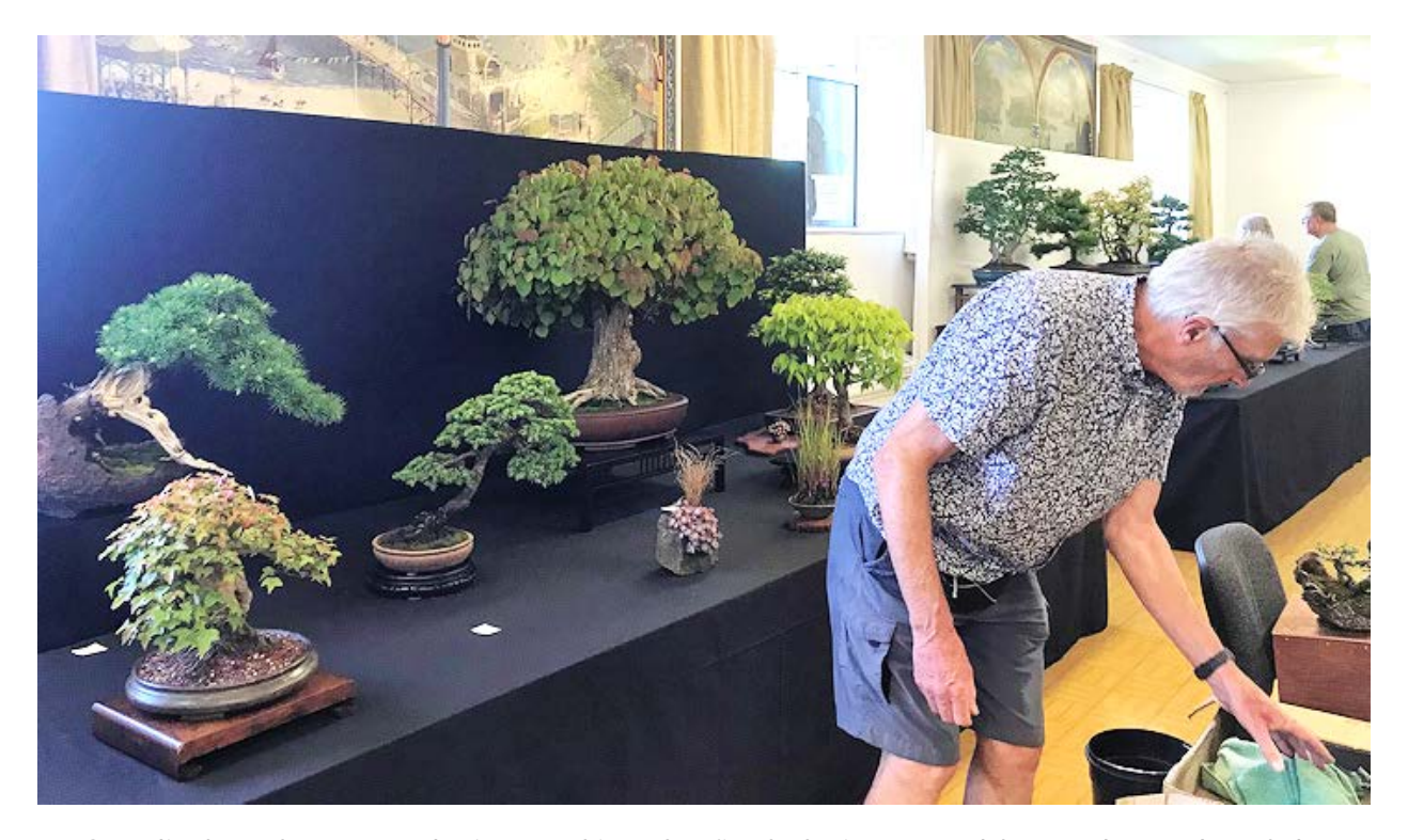
Our display almost ready, just making the final choice on tables and wooden slabs

Once again, we were invited to attend this excellent show by our friends at the Blackmore Vale Bonsai Club. Held in the Remembrance Hall at Charlton, this show usually attracts a large number of visitors as well as a host of high-class entries from the surrounding clubs. This year, there were displays by Blackmore Vale, Somerset, Warminster and Staverton and lots of goodies on sale from a number of traders.