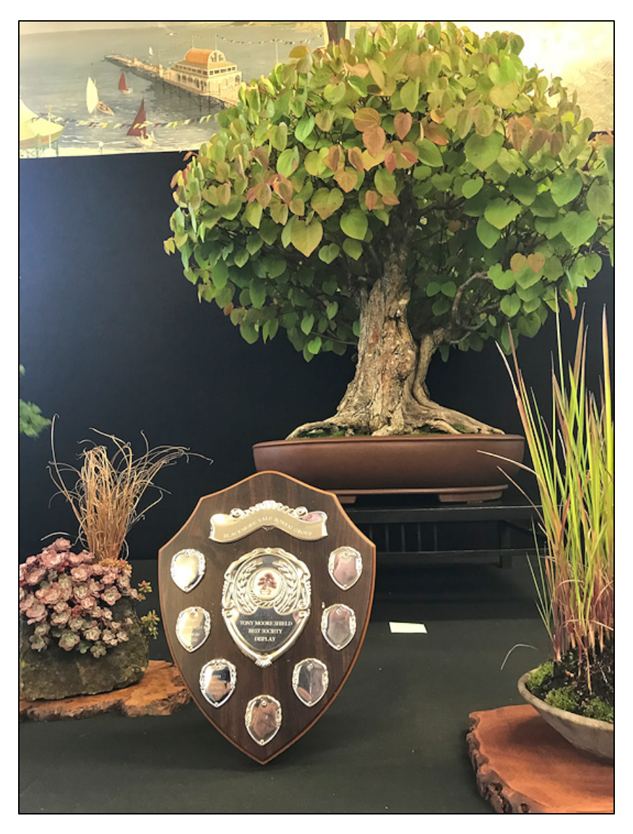
And the winner of the Best Club Display is – Somerset Bonsai Society. It pays to listen to the judges' comments!

The show closed its doors at 3.00pm, and with everyone lending a hand, the hall was soon cleared and exhibitors were off on their way home. As I navigated the summer traffic on the busy A30, I reflected on some of the days points. What had I learned from this experience? Firstly, you don't need to go to big shows to see high quality trees, so please support your local shows. When the judge tells you what they are looking for in a winning display, try and give them it. Look at the finer points of your display; does it look the best that it can be? And finally, have faith in the quality of your own trees and don't be afraid of putting them into shows.