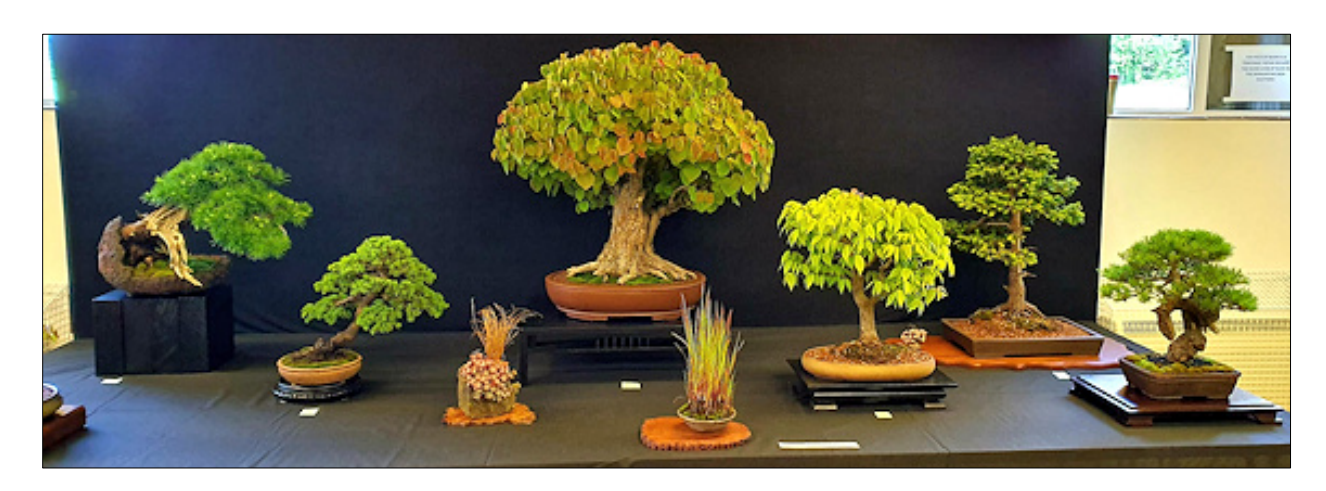
Our display, ready for the judge's critique!

Once again, we were invited to attend this excellent show by our friends at the Blackmore Vale Bonsai Club. Held in the Remembrance Hall at Charlton, this show usually attracts a large number of visitors as well as a host of high-class entries from the surrounding clubs. This year, there were displays by Blackmore Vale, Somerset, Warminster and Staverton and lots of goodies on sale from a number of traders.