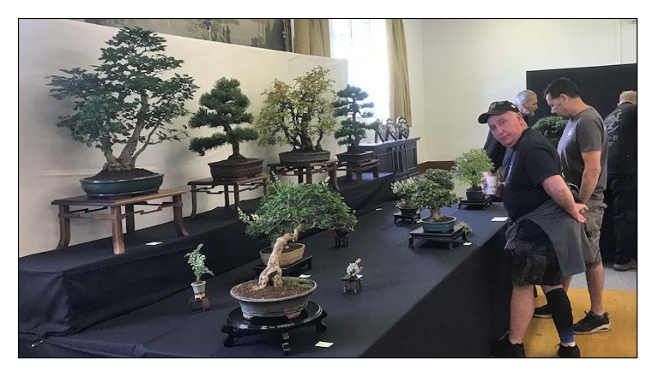
The Warminster Club's display

The doors opened at 10.00 am, and a steady flow of visitors arrived to view the trees, chat with the exhibitors and purchase a few pots and trees. For some reason, visitor numbers were down on last year and the tailed off in the afternoon. Thankfully, the host club had laid on refreshments for all including snacks and cold drinks, which was very welcome, and the fish and chip van arrived at lunch time, providing a very welcome distraction.